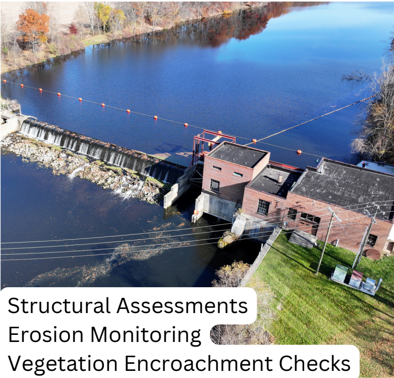
Structural Assessments Erosion Monitoring Vegetation Encroachment Checks