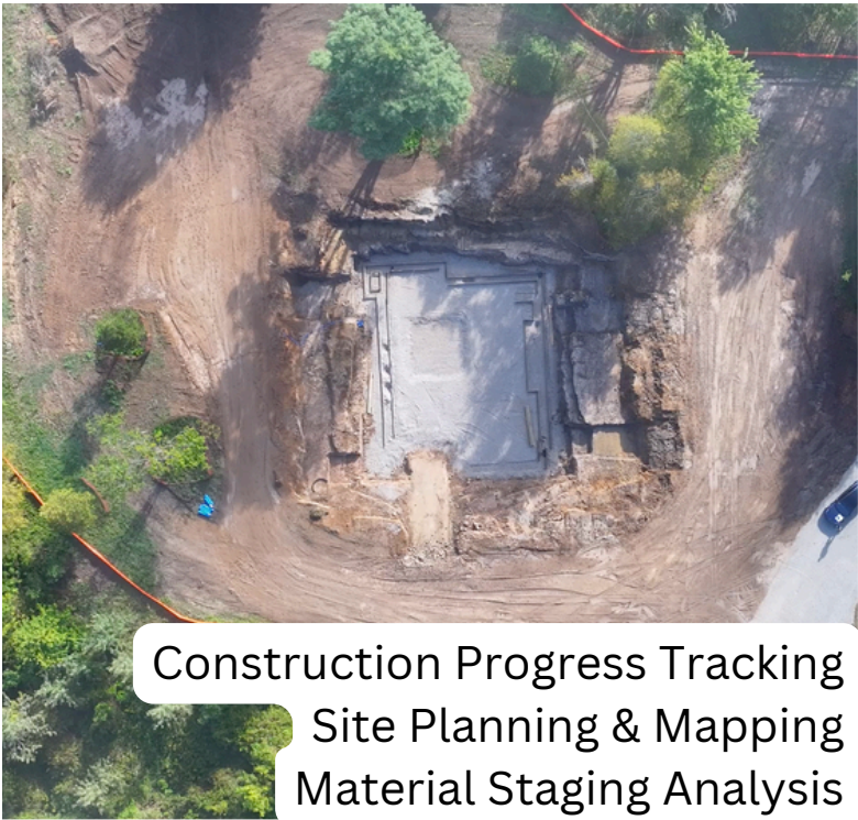
Construction Progress Tracking Site Planning & Mapping Material Staging Analysis

Experienced Operators – Supporting industries like construction, roofing, real estate, and solar.