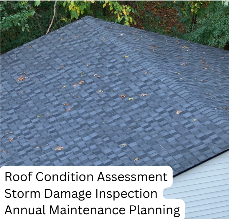
Roof Condition Assessment Storm Damage Inspection Annual Maintenance Planning

High-quality aerial imaging to support your projects from above.